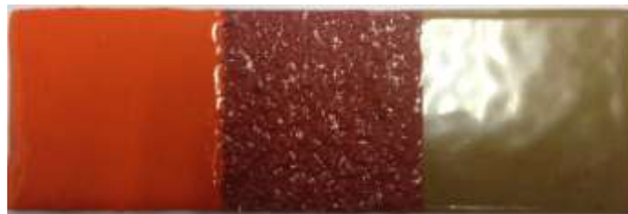
RU 500 as sealer