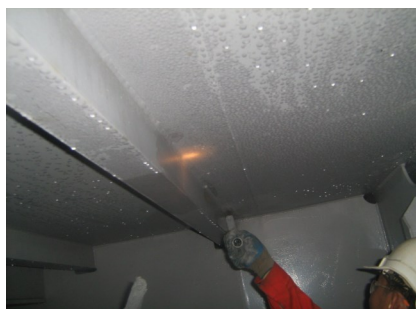
Applying RA 500M in wet surface in a ballast tank