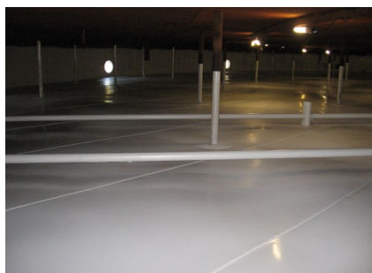
RA 564 applied in crude oil tank BP Dalmeny