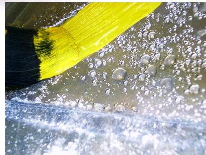
RA 500M - applied to a completely wet substrate